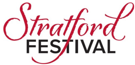
Tableau the Story